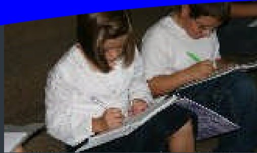
Students in HCAA's "Aspiring Wordsmiths" Class